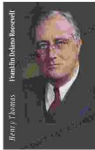
Image of World War II: Franklin Delano Roosevelt led the United States through World War II.