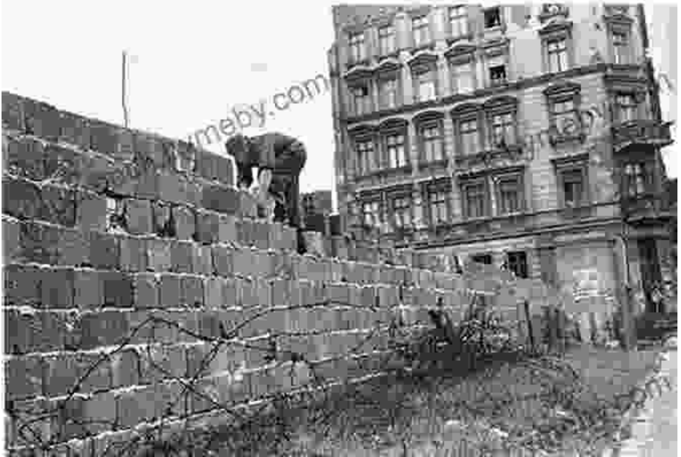
The construction of the Berlin Wall in 1961, a physical manifestation of the ideological divide between East and West during the Cold War.